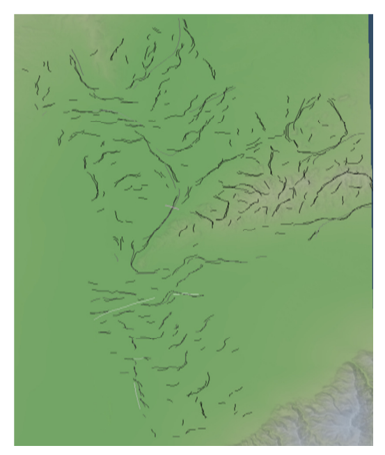
Figure 3: A perspective view of the SRTM terrain and the upwards continued multi-scale edges, derived from the FTG data. The white lines have a stronger amplitude.

Braga M. A., I. Endo, H. F. Galbiatti and D. U. Carlos, 2014, 3D full tensor gradiometry and Falcon systems data analysis for iron ore exploration: Baú Mine, Quadrilátero Ferrífero, Minas Gerais, Brazil: Geophysics, v. 79, no. 5.